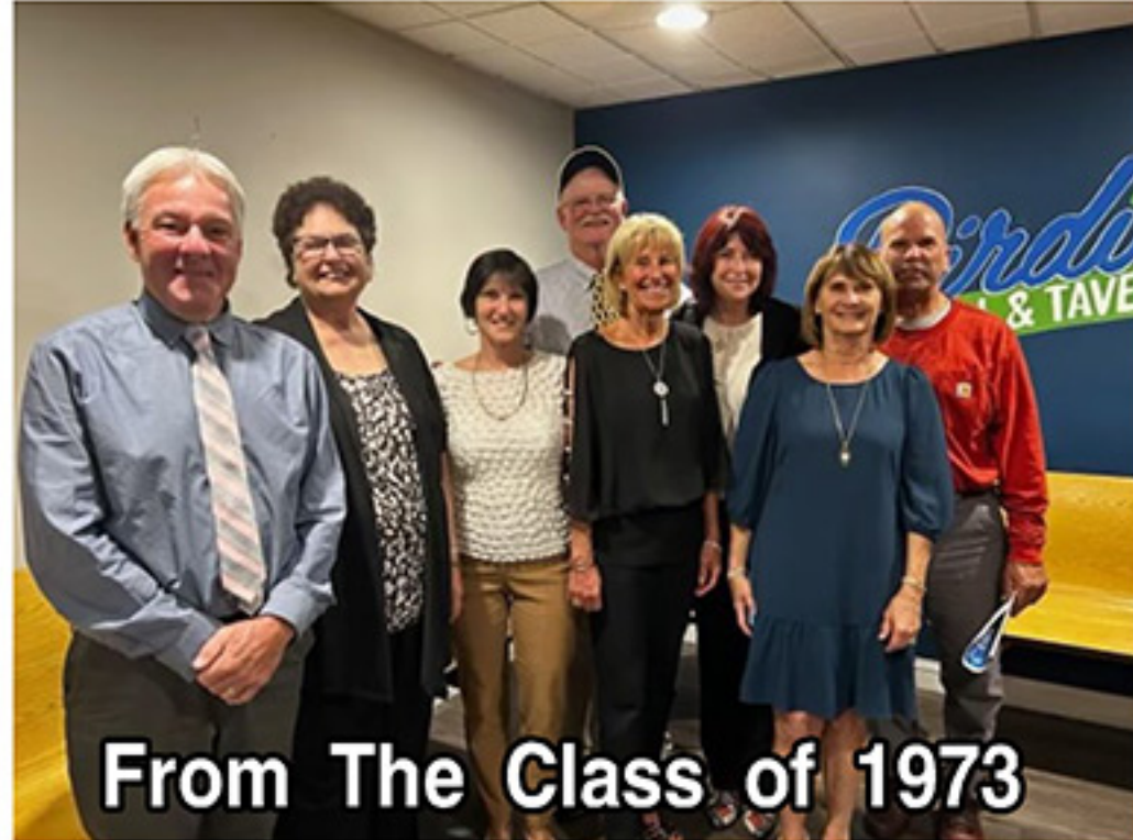
From The Class of 1973