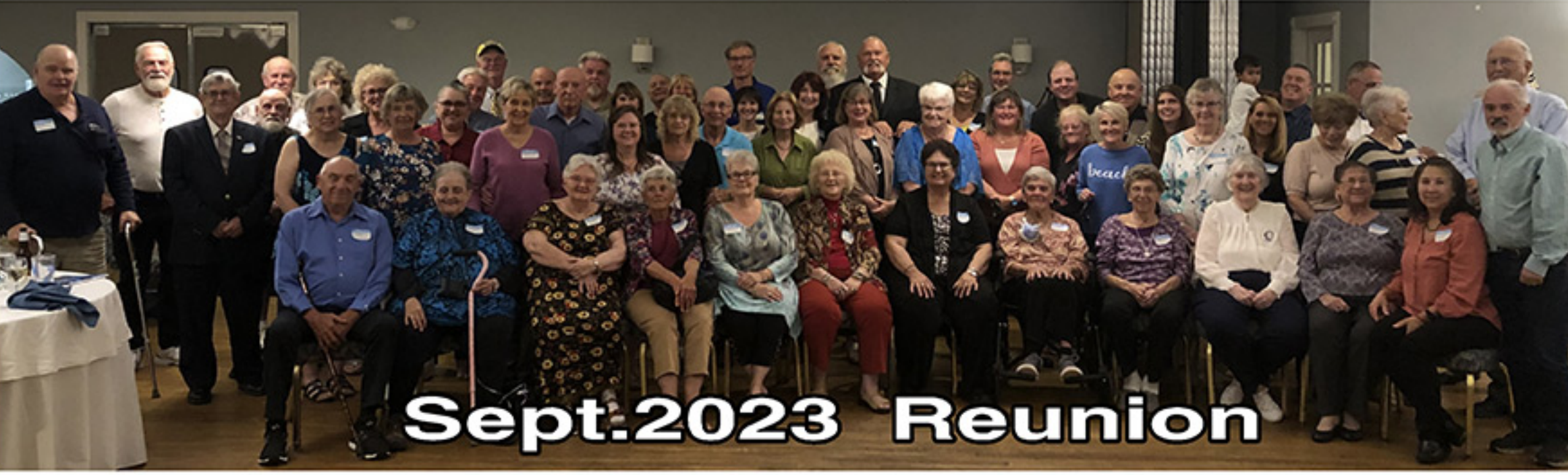
Sept. 2023 Reunion

All classes are invited as we honor those ending in 4 and 9 at this fall's All School Reunion. Once again a FREE Tailgate Party is Friday night at Jimmy the Greek's at 7 (or shortly after the OOBHS football game of which schedule has yet to be announced). Alumni from any year are welcome.