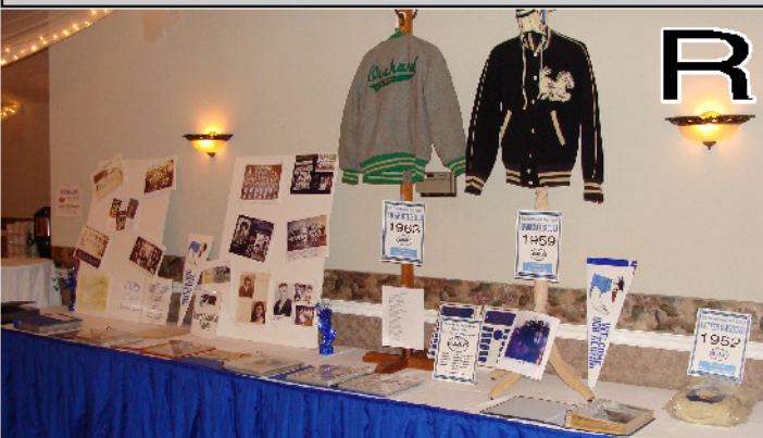
The ever growing Memorabilia Table at The All - School Reunion