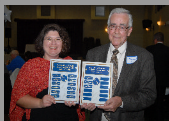
OOB HALL OF FAME

Sept. 21-23, 2012 Honoring years ending in 2 and 7!